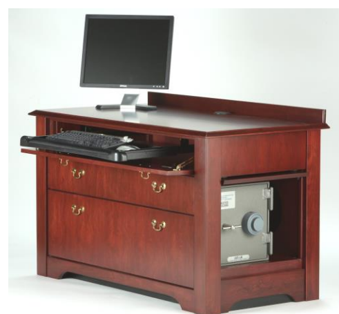
INCOGNITO Executive Secure Comms Workstation