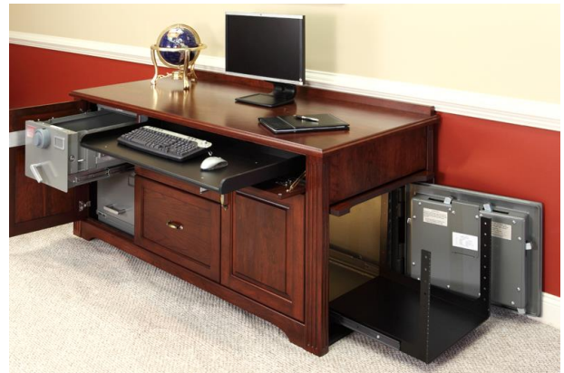
INCOGNITO Executive Secure Comms Workstation